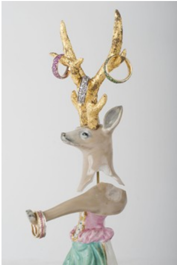
Art at Annoushka