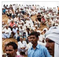
Highway in India Offers Solution to Land Fights