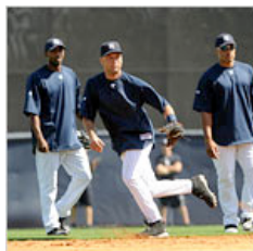
Jeter Puts Thorny Situation to Rest