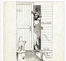
Disunion: Like a Thief in the Night

Home | World | U.S. | N.Y. / Region | Business | Technology | Science | Health | Sports | Opinion | Arts | Style | Travel | Jobs | Real Estate | Autos | Back to Top