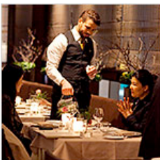
Restaurant Review: Ai Fiori